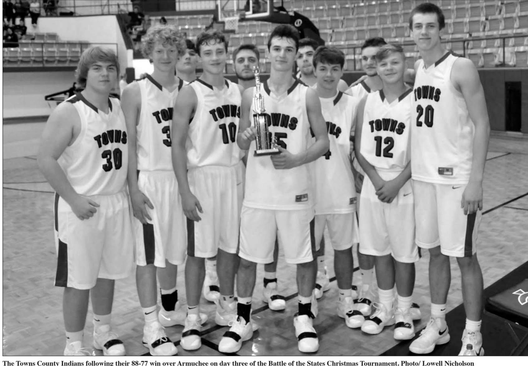
The Towns County Indians following their 88-77 win over Armuchee on day three of the Battle of the States Christmas Tournament.